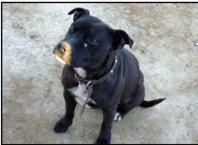
The Farty Pitbull

A few anecdotes...we found yet another huge lesser baboon spider in OUR ROOM the other day! Our local bush boy (6 yr. Caleb) took it outside for us, then promptly left a real-looking plastic salamander on my bed for me...his idea of a little joke. The other night one of the