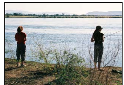
Fishing on the Zambezi River