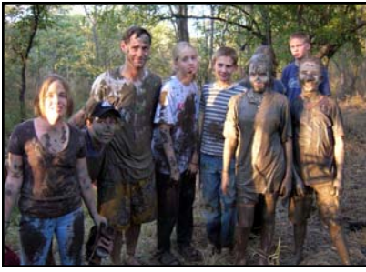
More Mudfight Pics

Last night, we set up the DVD player up at the outdoor dining hall and played "The Chronicles of Narnia" for the kids. Then this morning we led a Bible study around Narnia themes. Remember watching movies outside at camp? Now picture this, sitting on a hill in Africa, overlooking a river on one side and a lake/dam on the other...you finish watching an amazing sunset, countless bright and shining stars come out to fill the unpolluted night sky, you can see the upside down moon over the makeshift screen (a white sheet), you cuddle up in your sleeping bags with a bunch of kids (plus a couple Pitbull mixes and a Great Dane our camp protection) and watch a movie beamed onto a white sheet...drive-ins just wont seem the same anymore.