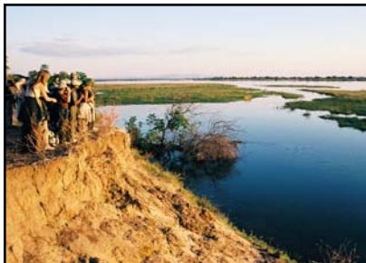
Rifa Kids on the Zambezi River