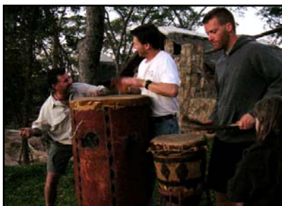
Drumming in the Sunset

We are running the Lasting Impressions camp from Wednesday until Saturday this week. We spent all day Monday and Tuesday planning the camp. It was a challenge planning a 4-day camp in two days, but I think we came up with some good stuff. Our focus of the camp is unity and friendship. After planning the camp on Monday, we went back up to the hill to watch the sunset, a test run before the kids arrive. The guys jammed on the African drums as the sun set over river...it was magical!!!