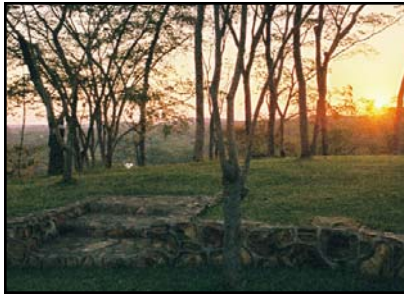
Lasting Impressions Camp

Al took us on a tour of the area where they have the camps. It's on the same property as their house, but a little farther away - they are on 400 acres. The camp is pretty rad (to quote the 80s)! It's got a ropes course and all these fun team/leadership building activities and a volleyball court. The camp housing is situated on a hill that on one side overlooks a lake and on the other side looks over the river. We will be staying in these cool safari-style tents with the kids. The dining area (which is still under construction) is the best place to view the sunset from. The scenery is absolutely stunning and while we were touring the camp we saw several baboons. Also, Al showed us the bones of black mamba that electrified itself on the wires of the camp last December.