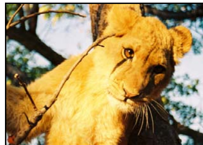
Picture from Lion Walk