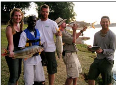
Fishing for Tiger Fish