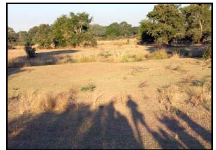
Our Shadows on the Savannah

The kids were definitely the most memorable thing about Rifa, but getting this rare opportunity to commune with the animals definitely gave me a much better appreciation for God's handiwork and his creation. Looking out onto the flood plane is a surreal experience! It's very "Land of the Lost"...one half expects to see a Tyrannosaurus Rex to walk by.