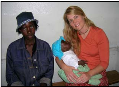
Me at Sanyati

Next we visited the various wards of the hospital, singing to the patients and delivering gifts as well as candies for the nurses and staff. Each of these people had a story to tell, even if they only spoke Shona, there was story in each of their eyes. And even as they were in pain and feeling sick, they were incredibly appreciative of the songs and very receptive to us. One woman patient insisted on singing to us, even though she could barely sit up in bed. I felt of all the places we have played songs on this trip, we sounded the best at this hospital...especially when we got the whole outpatient waiting room singing the only Shona song we knew. Their faces just lit up when they sang.