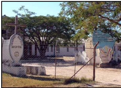
Sanyati Mission Hospital

Greetings once again from Zimbabwe! Many more incredible things have happened to us over the last few days that I thought I would share with you in my travelogue volume #3. I think you will find this email particularly interesting.