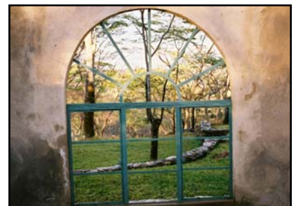
Window at Camp

The last morning of camp, we had some girl and guy bonding time. We girls made necklaces and beaded bracelets and also washed our dirty feet and painted toe nails...yes, we are girly even in Africa! The guys searched for snakes and ran off into the woods. On the last day, we had the kids continue with the post office box and write notes to their parents and each other. It was so sweet! The parents arrived in