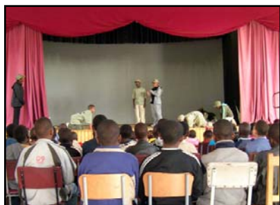
Eiffel Flats Skits

All this said, though, the foundations that are here in Lasting Impressions are quite incredible given the circumstances. One could think that places like Sanyati Hospital need all of our support...and places like that are important, but in order to truly create change, ministries like Lasting Impressions are imperative. Sanyati basically treats the symptoms of the issues in the country and keeps people healthy, and of course that is an incredible cause. But Lasting Impressions is focusing on creating the leaders of the future that will have moral values and a Christian faith that will help to guide them. Training leaders is important for the future of this country and is very much needed if there is to be any positive change here. I truly think the camp has the ability to affect a lot of people in a profound way.