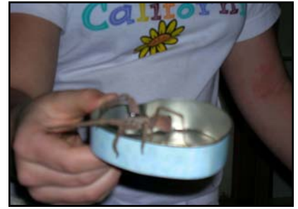
Lesser Baboon Spider

Later when I was looking at their wedding album, there was another lesser baboon spider in there. I didn't see it until Al moved my hand (which was unknowingly cupped over the spider) and said mind the spider, to which I screamed, jumped up, spilled my water and threw their whole wedding album on the floor. Al was razzing me about screaming over the spider and asked what I was going to do when I was chased by a elephant.