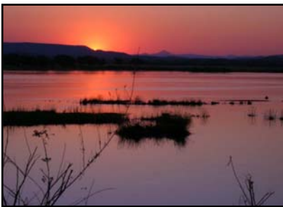
Sunset on the Zambezi River