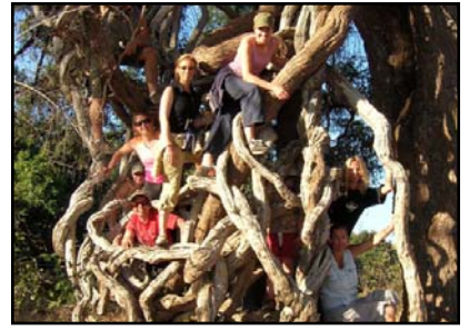
Our Team in a Tree