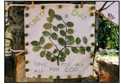
"Unity" - Our Camp Theme

Our second afternoon at Rifa, we took the kids fishing for tiger fish (same family as piranha, but huge). Here we were on the banks of the crocodile filled waters of the Zambezi River, surrounding by several pods of hippos, with 6th grade kids having target practice with live ammo rifles behind us as we were fishing for piranha...but don't worry mom, were not in any danger!