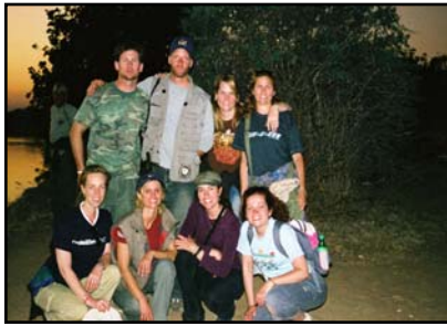
Sunset on the Zambezi

We are having an amazing and very unique experience! We continue in prayer for those we have come in contact with and those we have yet to meet. We have been getting some amazing feedback from people that having us here is really raising their spirits...I hope and pray we will continue to do so. We are looking for more ways to minister to the people here.